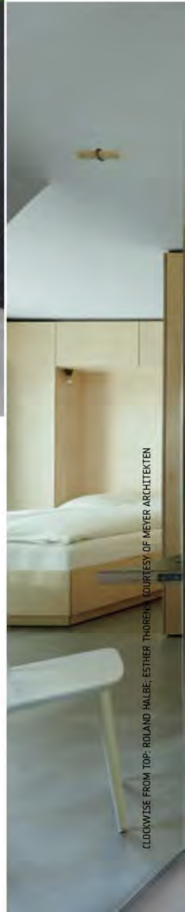
CLOCKWISE FROM TOP: ROLAND HALBE; ESTHER THORENY; COURTESY OF MEYER ARCHITECTEN

Clockwise from top left: Tinted stucco clads the upper three levels. Aluminum signage is custom. Prefabricated concrete lines the stairwell. Acoustical fabric wall covering decorates the lobby. Birch panels a suite. Michael Meyer and Benjamin Krampulz founded Krampulz Meyer Architekten before launching Meyer Architekten and Fesselet Krampulz Architectes.